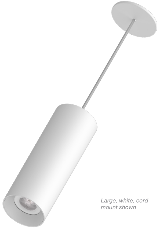
Large, white, cord mount shown